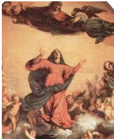
Detail from Titian's Assunta (1516-18), possibly the most famous depiction of the Assumption in Western Art.

There are even competing theories on whether the Blessed Virgin had died and was entombed prior to the Assumption, or if She never did die.